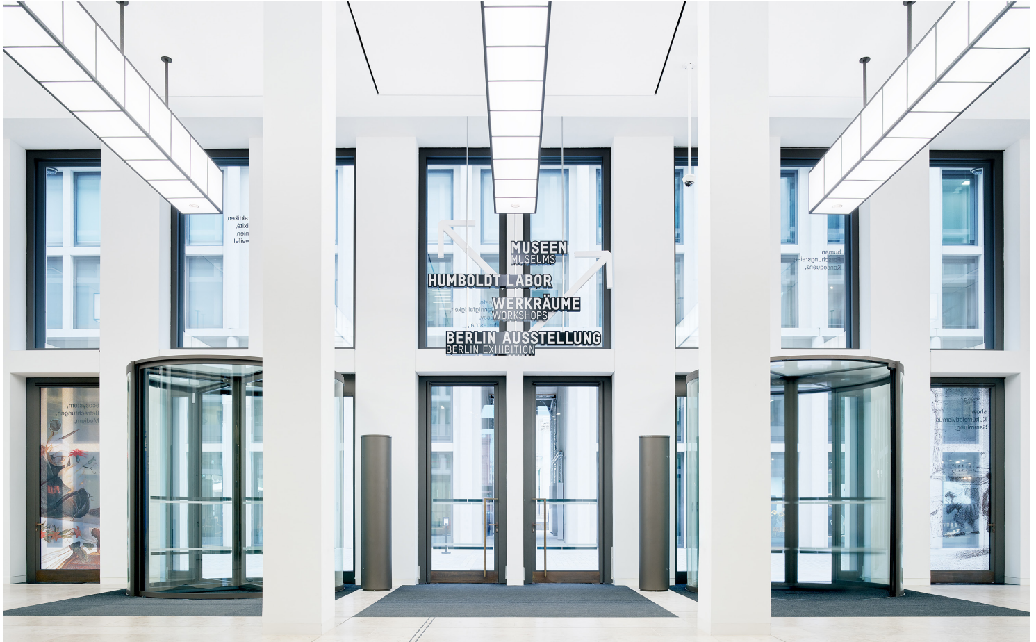
Stair Hall

Around 100,000 cubic meters of concrete and 20,000 tons of steel were used for the building: a reinforced concrete construction fronted by an independent 60 cm deep brick wall. It stands partly on concrete piles buried up to 40 metres deep, and partly on the remaining foundations of the Palace of the Republic. The tunnels of the U5 U-Bahn line also had to be taken into account when constructing the foundations which ascends and descends diagonally under the building.