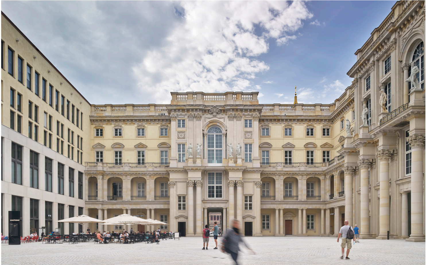
Schlüterhof © Stiftung Humboldt Forum im Berliner Schloss / Photo: Alexander Schippel

With its magnificent façades and portals, loggias and rich figural decoration, the approximately 50×80 metre Schlüter Courtyard forms the architectural heart of the palace. Characterised by courtly ceremony and grand gestures, in its time this square was regarded as one of the most impressive examples of Baroque architecture.