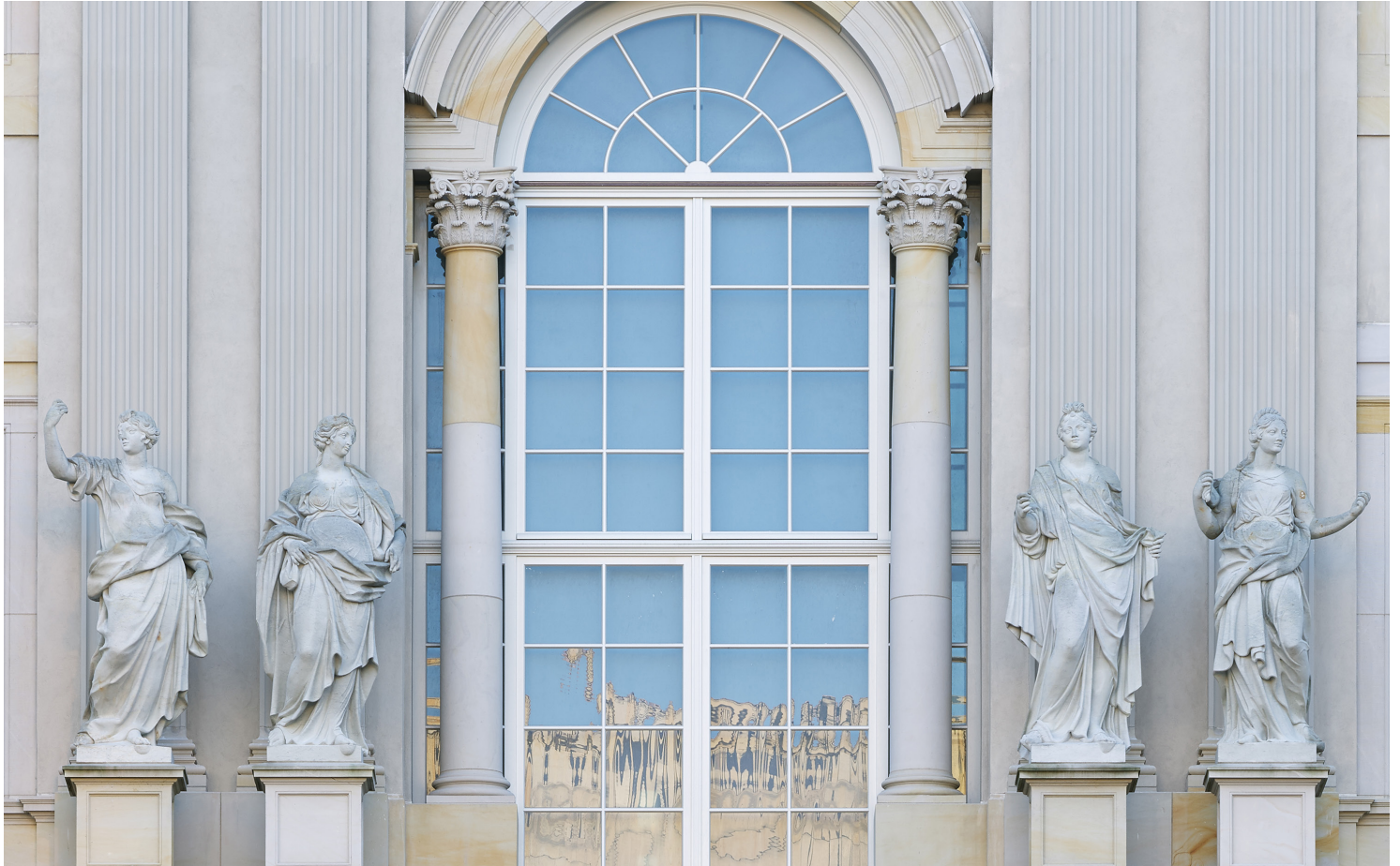
Façade Detail of the Schlüter Courtyard

In both their craftsmanship and artistic and technical implementation, the reconstructed Baroque façades have remained as true to the original as possible. In order to produce the more than 2,800 sandstone figures required, the Stiftung Humboldt Forum established the Schlossbauhütte in Spandau in summer 2011. First, the sculptors, plaster moulders and stucco artists modelled the – sometimes colossal – decorative elements in clay. They then made plaster casts, and finally carved them from sandstone using the traditional pointing technique. Modern materials and techniques were also sometimes used to produce the models. For example, the elements of Portal 4, which had remained preserved at the State Council building, were made using 3D printing as a model for duplication by the stone sculptors. In addition, restorers have reconditioned the original preserved sculptures and fragments for incorporation into the façades or as exhibits in