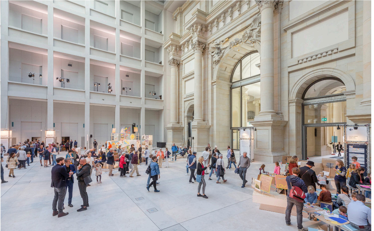
Foyer of the Humboldt Forum with Installation from Salapanga Falkner & Larass GbR

Franco Stella has designed the Foyer as a 'theatre of the present': a spacious entrance hall with open porticoes and galleries. Cubic in shape, with a side length of around 35 metres, it is topped by a steel-framed glass roof. Galleries extend over four floors in its three modern-proportioned sides. The western side is dominated by Portal 3: the masterpiece created by Eosander, the Palace's second great Baroque architect. Known as the Eosander Portal, the entire structure of this colossal gateway, originally constructed in 1713, has been completely reconstructed, with its outer and courtyard sides as well as the architectural order of the columns in the inner passageway, and the dome – a 19th-century addition. It is based on the triumphal arch of Septimius Severus at the Forum Romanum in Rome.