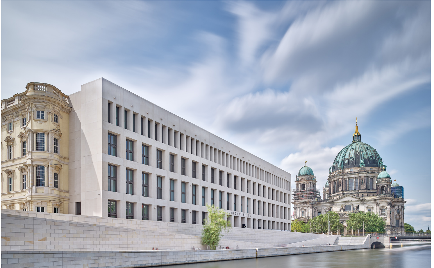
East Façade © Stiftung Humboldt Forum im Berliner Schloss / Photo: Alexander Schippel

The exterior areas of the Berlin Palace open up new access ways to the historical centre. On the eastern side, a new path to the Spree has been created: a 90-metre ramp linking the riverbank path with the Humboldt Forum. The ramp, along with all the other open spaces, was planned by bbz Landschaftsarchitekten Berlin. To the north, to the right and left of Portal 4, the new Palace Terraces make their mark on the Lustgarten area. Made of granite, the Palace Terraces offer a green setting with a view to the square, the Lustgarten, cathedral and Altes Museum, as well as Unter den Linden. On the terraces themselves, a planting pattern inspired by the historical design of garden architect Peter Joseph Lenné is taking shape, allowing visitors to experience the research and work of Alexander von Humboldt in the form of vegetation tableaux. They represent the three time zones of the continents which Humboldt visited: Eurasia, South America and North America.