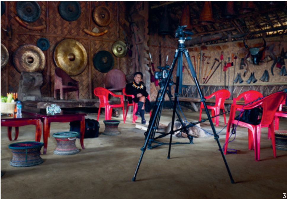
1 View of the temporary exhibition Naga Land, Voices from Northeast India at the Humboldt Forum © SHF / Staatliche Museen zu Berlin, Ethnologisches Museum, photo: Alexander Schippel 2 Mangko Akir Collection © Imchatsung Imchen 3 Untitled (from the series Looking at a tree again ) © Zubeni Lotha

All over the world, minorities are fighting for cultural self-determination or political autonomy. One such minority are the Naga – an umbrella term for more than thirty different tribal groups which, despite many similarities, differ in their culture and language and in the way they see themselves. The majority of the approximately three million people now live in the state of Nagaland in north-eastern India.