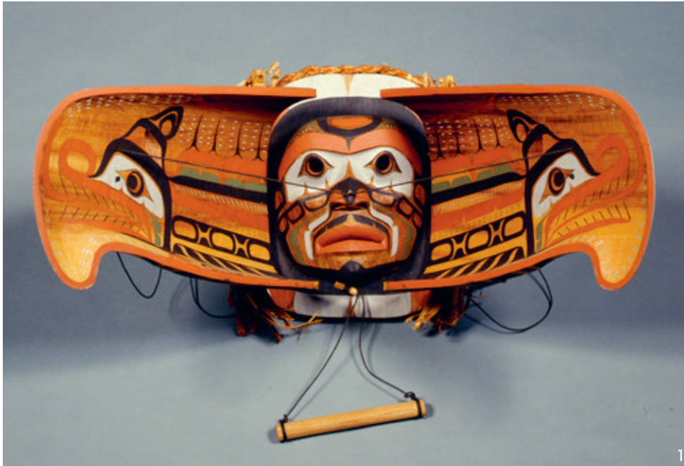
1 Depiction of an eagle, double-headed snake monster Sisiutl when unfolded 2 View of the temporary exhibition Ts'uu - Cedar. Of Trees and People at the Humboldt Forum

Until 12 January 2025 2nd Floor, Room 201 Free admission