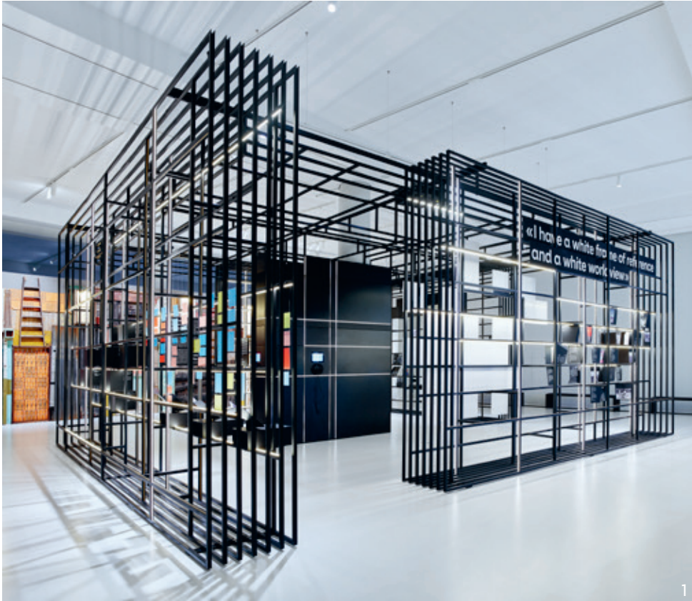
1 Temporary exhibition Matters of Perspective in the Humboldt Forum Scenography Valentine Koppenhöfer

Until Autumn 2025 2nd floor, Room 214 Free admission